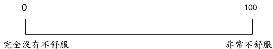
圖一：整體健康狀態 (General Health Status)